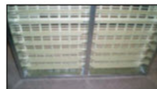
Deck Assembly Underside